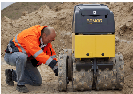
Flexible working widths Original BOMAG drum extensions