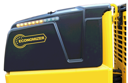
Higher quality, lower costs ECONOMIZER - The compaction display (optional)